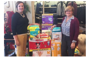
DIAPER DRIVE PAGES 3-4