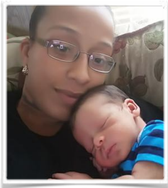
“My nurse was so nice and gave me a lot of support that I would have not been able to get anywhere else”