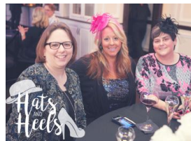
HATS AND HEELS PAGE 3